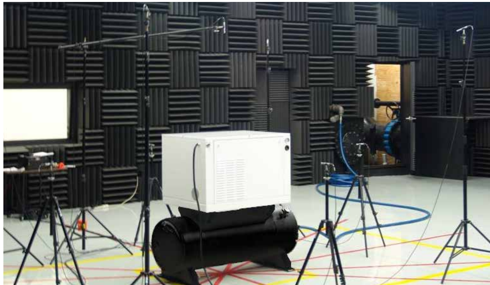
Paradigm tested to CAGI adopted ISO 2151 certified standards

With a commitment to research and development, Gardner Denver provides our customers with products which uphold our tradition of quality and proven results. As part of the new product development process, the Paradigm has passed extensive design reviews as well as performance, endurance and sound testing requirements.